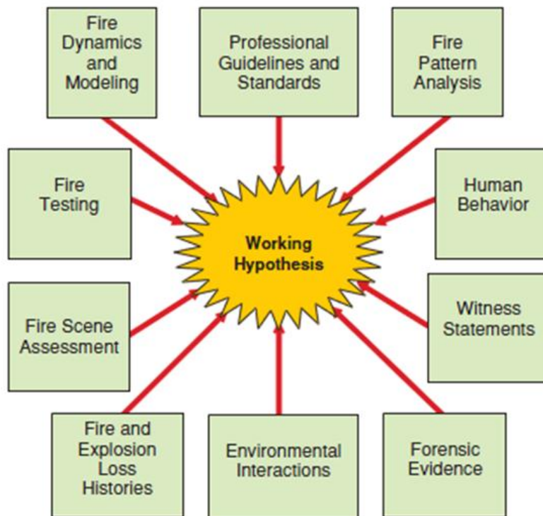
Figure 2. Many of the Factors used in forming a Working Hypothesis. (Source: D.J. Icové and J.D. DeHaan, Forensic Fire Scene Reconstruction , Pearson-Prentice Hall, Upper Saddle River, New Jersey, 2 nd Edition, 2009.)